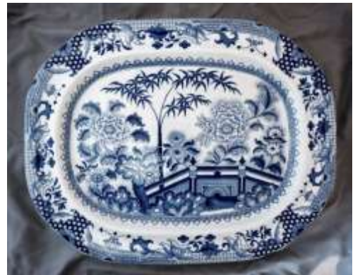
Platter; Bamboo and Peony pattern; Davenport, Longport, Staffordshire, England. Montpelier Foundation, MF2018.10.1

. The interpretation of a historic property relies on a highly collaborative team of "history detectives" to bring both the site and the personal stories of its residents to life. Archaeologists, curators, historians, preservationists, and educators tirelessly mine every clue to ensure historical accuracy. In this presentation, we will view the fruits of this collaboration during an armchair tour of Montpelier, with a focus on the impressive collection of ceramics which includes a wide variety of wares: beautifully decorated French porcelain and Chinese porcelain, and painted and printed British pottery.